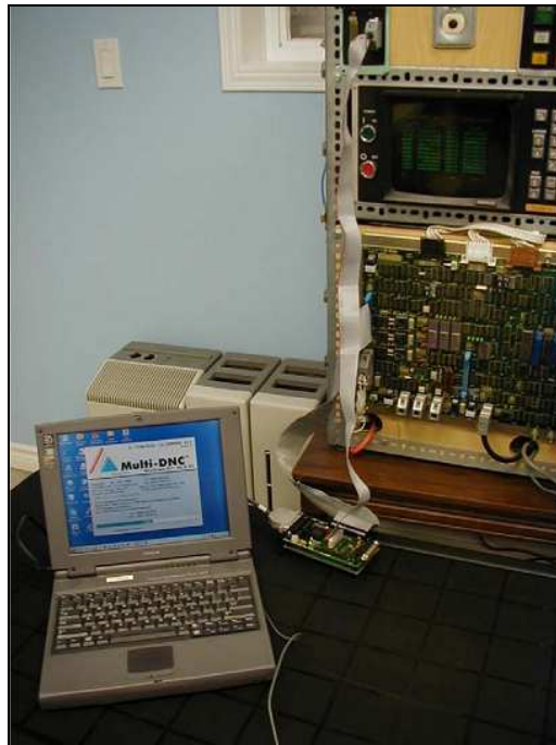
Serial Port of Computer is connected to left side of Mx1000

Note Parameter 2 bit 5 (1010 0000) is on to enable Facit 4070 Punch communications on a Fanuc 6MB